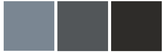
7035 Light Grey