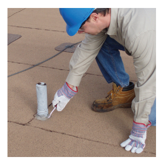
Penetrations require special attention during periodic inspections.