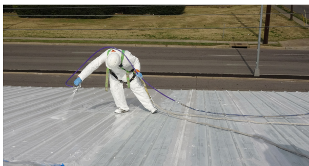
Paraflex Metal Roof Coating

Siplast Paraflex System is developed to offer building owners a high performance solution for projects in sensitive environments. Fluid-applied Paraflex has a very low odor signature, and is low VOC and isocyanate-free. The Paraflex formulation is based on Silane Terminated Polymer (STP) chemistry.