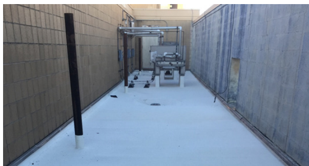
Paraflex Liquid Membrane