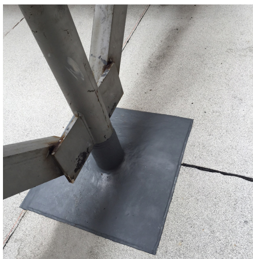
Paraflex 531 Liquid Flashing